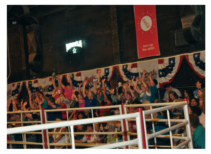
Rodeo Action A Crowd Pleaser