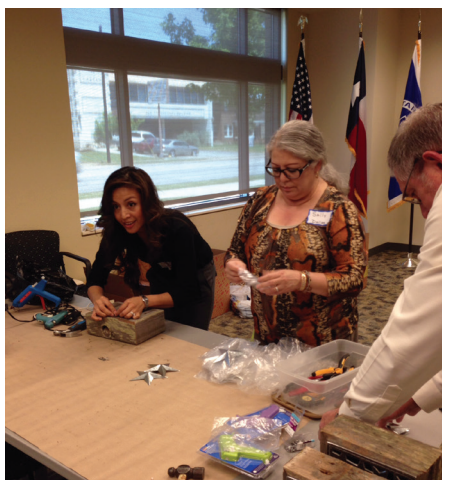
Putting \ on \ the \ final \ touches....you \ know \ it's \ serious \ when \ tools \ come \ out!