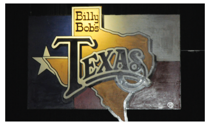
Billy Bob's Texas - Worlds Largest Honkeytonk