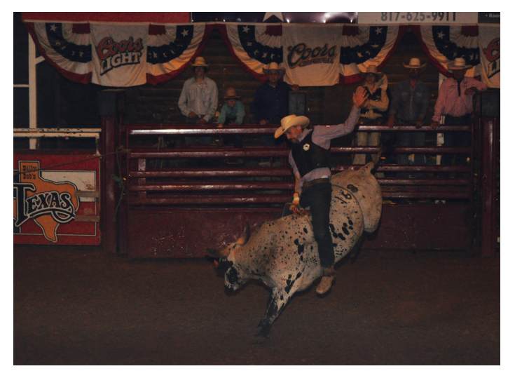
Ride 'Em Cowboy