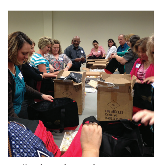
Stuffing the tote bags....what a great team effort!