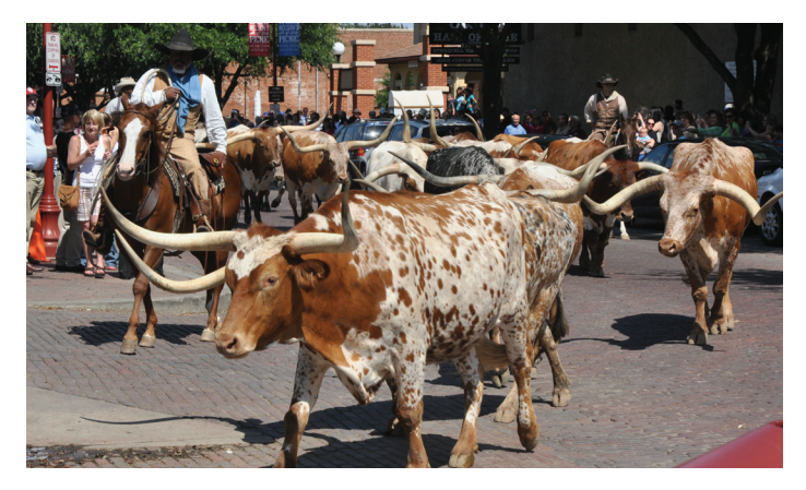
Longhorn Cattle Drive