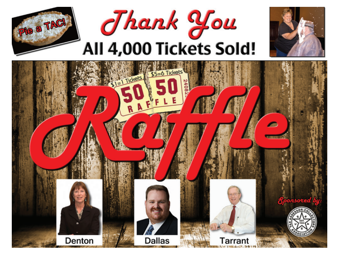
Thank You 50-50 Raffle